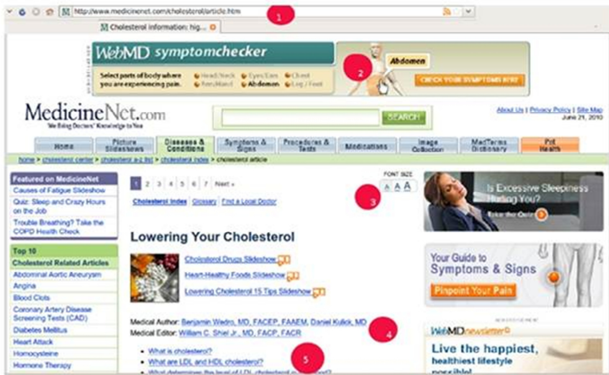
Illustration 7: Lowering your cholesterol. Available from http://www.medicinenet.com/cholesterol/article.htm . Last visited: June 21, 2010

In addition by noting the authority, content production procedures, intellectual presentation, one may also pay attention to the simplicity and clarity of the language used to deliver the content, the professional and pleasant design of the web site. From our previous experience with Medline Plus we learned that it is directory of good quality carefully selected web resources providing consumer health information. In conclusion, this web page about "cholesterol" web page provides content that is very likely to be of good quality.