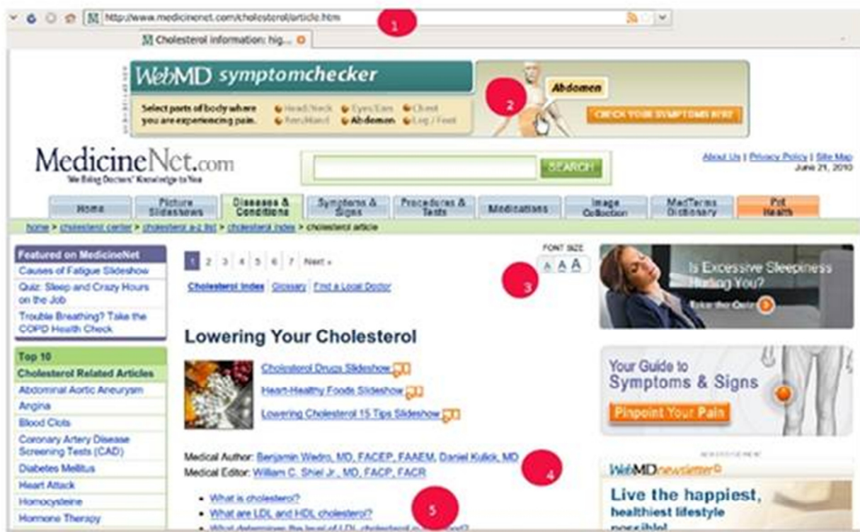
Illustration 7: Lowering your cholesterol. Available from http://www.medicinenet.com/cholesterol/article.htm . Last visited: June 21, 2010

In addition by noting the authority, content production procedures, intellectual presentation, one may also pay attention to the simplicity and clarity of the language used to deliver the content, the professional and pleasant design of the web site. From our previous experience with Medline Plus we learned that it is directory of good quality carefully selected web resources providing consumer health information. In conclusion, this web page about "cholesterol" web page provides content that is very likely to be of good quality.